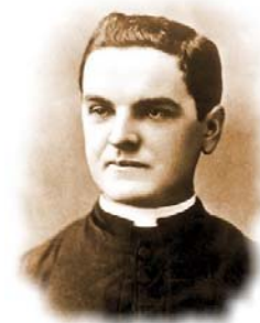
Father Michael J. McGivney Born August 12, 1852 Died August 14, 1890 (age 38) Founder of the Knights of Columbus